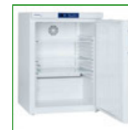
Liebherr LKUexv 1610 Laboratory Refrigerator - 141 Litre

Capacity: 107 Litre Config: Under Bench 830mm H x 495mm W x 620mm D Product Code: FPD-09795