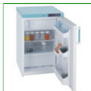
LEC LSC119UK Laboratory Fridge Freezer

Capacity: 83 Litre Config: Bench Top 660mm H x 502mm W x 540mm D Product Code: FPD-09808