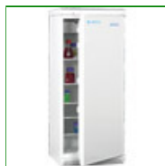
Labcold RLPF09043A Fan Air Circulated Laboratory Fridge 285 Litres

Capacity: 285 Litre Config: Free Standing 1435mm H x 600mm W x 625mm D