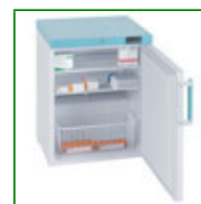
LEC PE207C - Pharmacy Fridge 82 Litre with Solid Door

Capacity: 75 Litre Config: Bench Top 790mm H x 450mm W x 430mm D Product Code: FPD-07731