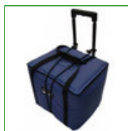
30 Litre Thermal Carry Bag with Trolley and 3 Separators

Capacity: 30 Litre 360mm H x 400mm W x 340mm D