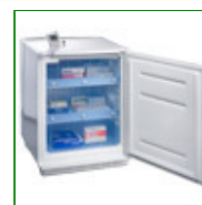
53 Litre Silenco Lockable Pharmacy Absorption Fridge

Capacity: 45 Litre Config: Bench Top 715mm H x 380mm W x 375mm D Product Code: FPD-06627