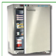
Labcold RPFG05043 - 150 Litre Advanced Pharmacy Fridge with Glass Door

Capacity: 150 Litre Config: Under Bench 820mm H x 600mm W x 620mm D Product Code: FPD-07551