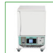
Blood Bank 48 Pack with Solid Door

Capacity: 78 Packs 830mm H x 520mm W x 600mm D Product Code: FPD-09663