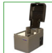
Shoreline SMP26 - 26 Litres Portable Medical Fridge

Capacity: 26 Litre 385mm H x 345mm W x 510mm D