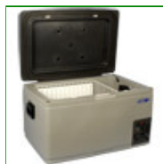
Shoreline SMP65 - 65 Litres Portable Medical Fridge

Capacity: 65 Litre 450mm H x 725mm W x 510mm D