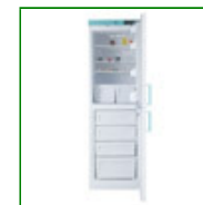
LEC LSC324UK Laboratory Fridge Freezer

Capacity: 263 Litre Config: Upright Refrigerator 1680mm H x 540mm W x 600mm D Product Code: FPD-09810