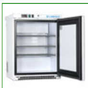
Labcold RAFR05202 Advanced Laboratory Freezer 150 Litres

Advanced freezers are completely constructed from powder coated mild steel with a stainless steel interior so are built to last. Insulated with Envirofoam and fitted with micro processor controllers these freezers provide accurate temperature control with low GWP. All Advanced freezers have optimised air circulation for superior temperature control and feature a temperature display, high and low temperature alarms and door locks fitted as standard. For ease of positioning the larger cabinets have heavy duty wheels with a brake. Designed for any situation where accurate temperature control is vital and there is a need to store a large quantity of product. Advanced freezers can be fitted with access ports and remote alarm contacts.