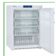
Liebherr LGUex 1500 Laboratory Freezer - 139 Litre

Capacity: 120 Litre Config: Upright Freezer 850mm H x 545mm W x 565mm D Product Code: FPD-07540