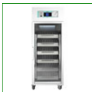
Blood Bank 432 Pack with Glass Door

Lec Medical bloodbanks have been designed in conjunction with bloodbank centres and we are proud of the many features they provide. Each bloodbank is built to order in the UK and can be delivered directly to your haematology department. All bloodbanks come with a 48 hour battery back-up for the controller, an energy efficient LED light and auto defrost as standard.