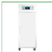
Blood Bank 432 Pack with Solid Door

Capacity: 439 Packs 1980mm H x 680mm W x 850mm D Product Code: FPD-09669