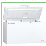
Labcold RLCF1520 Sparkfree Laboratory Freezer 447 Litres

Capacity: 375 Litre Config: Upright Freezer 1850mm H x 595mm W x 640mm D Product Code: FPD-04933