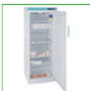
LEC PSR273UK - Pharmacy Fridge 273 Litre with Solid Door

All pharmacy fridges are developed with reliability and ease of use in mind. Our pharmacy refrigeration range conforms to the guidelines set out by the RPSGB and maintains an internal temperature of between +2°C and +8°C. We have added a number of improvements to certain popular models to ensure we are offering you the best possible secure and reliable refrigerated storage. Many of our fridges are available with different plug options for Europe and Australasia, or with compressors operating at 60Hz.