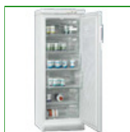
Labcold RLVF07203LK - 180 Litre Sparkfree Laboratory Freezer with Solid Door

Capacity: 180 Litre Config: Upright Freezer 1440mm H x 544mm W x 570mm D Product Code: FPD-07708