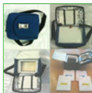
Three Inch Vaccine Thermal Carrier

Config: 3 Inch Deep Internal Chamber 240mm H x 320mm W x 280mm D