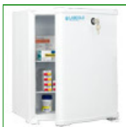
Labcold RLPR02042 Sparkfree Laboratory Fridge 60 Litres

The Sparkfree Fridges is engineered to store flammable materials safely with no sources of ignition inside the chambers. Everything that could conceivably cause a spark, such as the controller, is located outside of the refrigerator chamber making these fridges and freezers an important part of laboratory safety. Designed specifically for laboratories, these refrigerators are solidly built and come in a range of sizes, from a compact bench top to a large 400 litre refrigerator. All Sparkfree fridges are factory fitted with a door lock for optimum security.