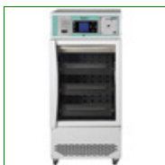
Blood Bank 72 Pack with Glass Door

Capacity: 78 Packs 830mm H x 520mm W x 600mm D Product Code: FPD-09664