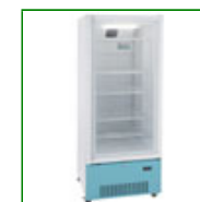
LEC PG1607C - Pharmacy Fridge 444 Litre with Glass Door

Capacity: 444 Litre Config: Free Standing 1688mm H x 685mm W x 910mm D Product Code: FPD-09749