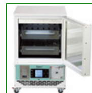
Blood Bank 48 Pack with Glass Door

Capacity: 78 Packs 780mm H x 522mm W x 600mm D Product Code: FPD-09662