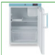
LEC ISR27C Laboratory Fridge Freezer

This is the latest generation of combined sparkfree laboratory refrigerator and freezer. Providing all the routine storage required on a floor area no bigger than a standard fridge. For laboratory and general use where there is a concern that volatile, flammable materials or components might be stored now, or at some point in the future. Both refrigerated and frozen samples can be stored and accessed within the same small floor area.