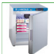
Labcold IntelliCold™ RLDF0110 - 36 Litre Pharmacy Fridge with Solid Door

Capacity: 28 Litre Config: Bench Top 580mm H x 422mm W x 393mm D Product Code: FPD-09818