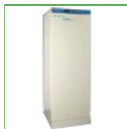
Labcold RLSP1505 - 400 Litre Sparkfree Laboratory Fridge with Solid Door

Capacity: 360 Litre Config: Upright Refrigerator 1750mm H x 585mm W x 655mm D Product Code: FPD-04917