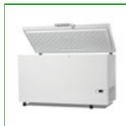
LEC CLT296 Low Temperature 296 Litre Chest Freezer

Capacity: 140 Litre Config: Chest 885mm H x 720mm W x 600mm D Product Code: FPD-10214