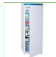
Labcold IntelliCold™ RLDF1010 - 300 Litre Pharmacy Fridge with Solid Door

Capacity: 273 Litre Config: Free Standing 1565mm H x 595mm W x 660mm D Product Code: FPD-09756