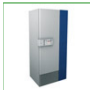
LEC ULT342 Low Temperature 322 Litre Upright Super Freezer

Capacity: 113 Litre Config: Chest 1080mm H x 730mm W x 850mm D Product Code: FPD-10220