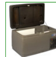
Shoreline SMP41 - 41 Litres Portable Medical Fridge

Capacity: 41 Litre 400mm H x 610mm W x 385mm D