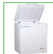
Labcold RLCF0720 Sparkfree Laboratory Freezer 215 Litres

Capacity: 180 Litre Config: Upright Freezer 1440mm H x 544mm W x 570mm D Product Code: FPD-07709