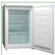
Labcold RLVF04202A Sparkfree Laboratory Freezer 120 Litres

Capacity: 102 Litre Config: Under Bench 830mm H x 495mm W x 620mm D Product Code: FPD-09805