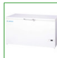
Labcold ULTF420 Compact Ultra Low Temperature Freezer 383 Litre

Capacity: 276 Litre Config: Chest 885mm H x 1260mm W x 695mm D Product Code: FPD-04991