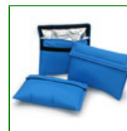
A4 Thermal Vaccine Wallet