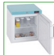
LEC ISU27C Laboratory Freezer 50 Litres

Capacity: 36 Litre Config: Upright Freezer 515mm H x 440mm W x 500mm D Product Code: FPD-09918