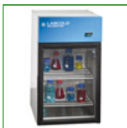
RLCG0100 Labcold Cooled Incubator with Glass Door

Cooled incubators are ideal for microbiology or any application where precise and consistent temperatures at or below room temperature are demanded. Available in a range of sizes from a small benchtop model through to a large 600 litre unit constructed from mild steel with stainless steel interior, these new cooled incubators from Labcold all feature fan air circulation for even temperature distribution and microprocessor controlled temperature regulation for improved accuracy and stability.