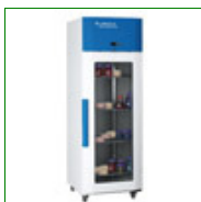
RLCG0600 Labcold Refrigerated Cooled Incubator - Glass Door

Capacity: 600 Packs Config: Free Standing 1980mm H x 720mm W x 820mm D