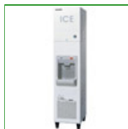
Hoshizaki Freestanding Ice/Water Dispenser (32kg/24h)

Capacity: 60 kg/24h Config: Free Standing 720mm H x 350mm W x 480mm D Product Code: FPD-10230