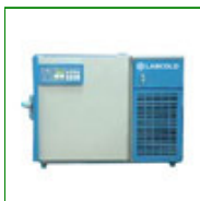
Labcold LULT0480 DuoCold Ultra Low Temperature Freezer 100 Litre

Designed to store materials safely at low temperatures, this NEW Labcold freezer features two compressors and is backed by a 5 year warranty comprising of three years parts and labour with maintenance visits with the option for a further 2 years parts only warranty, making this freezer a cost effective purchase. Featuring VIP technology, this freezer is designed to provide a large amount of storage whilst occupying as little laboratory space as possible.