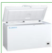
Labcold RLHE1345 Superfreezer 375 Litres

Capacity: 375 Litre Config: Chest 860mm H x 1500mm W x 735mm D