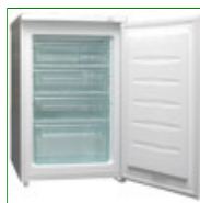
Labcold RLVF04202A/LK Sparkfree Laboratory Freezer 120 Litres

Capacity: 120 Litre Config: Upright Freezer 850mm H x 545mm W x 565mm D Product Code: FPD-07539