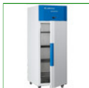
Labcold RAFR21262 Advanced Laboratory Freezer 571 Litres

Capacity: 150 Litre Config: Upright Freezer 830mm H x 600mm W x 620mm D Product Code: FPD-04946