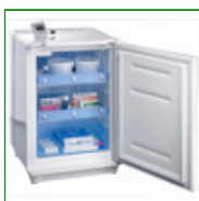
28 Litre Silenco Lockable Pharmacy Absorption Fridge

All pharmacy fridges are developed with reliability and ease of use in mind. Our pharmacy refrigeration range conforms to the guidelines set out by the RPSGB and maintains an internal temperature of between +2°C and +8°C. We have added a number of improvements to certain popular models to ensure we are offering you the best possible secure and reliable refrigerated storage. Many of our fridges are available with different plug options for Europe and Australasia, or with compressors operating at 60Hz.