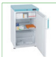
LEC PE307C - Pharmacy Fridge 107 Litre with Solid Door

Capacity: 107 Litre Config: Under Bench 830mm H x 495mm W x 620mm D Product Code: FPD-09754