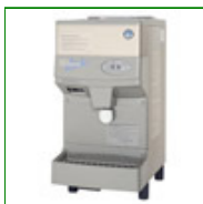
Hoshizaki Countertop Ice/Water Dispenser (60kg/24h)

Compact ice/water dispenser - Perfect for use in busy areas where people need access to an ongoing fresh water and ice supply, such as a hospital ward. Hygienic ice production - Ice moves straight to an airtight storage hopper as soon as it is produced, so it has no contact with light or air until it is dispensed, keeping its hygienic integrity.