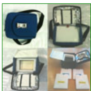
Two Inch Vaccine Thermal Carrier

The 3 Inch and 2 inch thermal vaccine carriers have been designed to maintain a temperature of between a 2° to 8°C for up to 8 hours, especially for use with vaccination programmes or specimen collection. The inner lid reduces thermal leakage helping to maintain temperature parameters despite repeated opening of the bag. Developed using NASA technology Polartherm™ is made up of an inner reflective layer, a hollow fibre filler and a waterproof woven PVC outer, the result of which is a material that is both tough and lightweight with excellent thermal control properties.