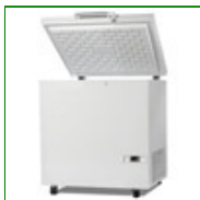
LEC CLT140 Low Temperature 140 Litre Chest Freezer

A variety of specialist Low Temperature Chest Freezers Minus 10°C to Minus 45°C for the storage of chemicals, samples and other important matter.