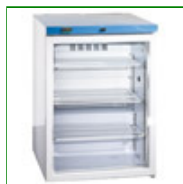
RLCG01502 Labcold Cooled Incubator with Glass Door

Capacity: 150 Packs Config: Under Bench 820mm H x 600mm W x 600mm D