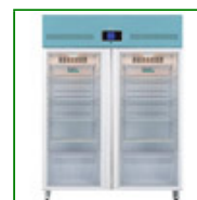
LEC PGR1200UK - Pharmacy Fridge 1200 Litre with Glass Door

Capacity: 600 Litre Config: Free Standing 1995mm H x 690mm W x 840mm D Product Code: FPD-10201