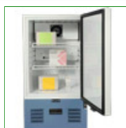
Shoreline SM45 - 45 Litres Pharmacy Fridge with Solid Door

Capacity: 45 Litre Config: Bench Top 530mm H x 470mm W x 465mm D Product Code: FPD-09743