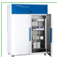
Labcold RPFR44042 - 1245 Litre Advanced Pharmacy Fridge with Solid Door

Capacity: 571 Litre Config: Free Standing 1980mm H x 720mm W x 820mm D Product Code: FPD-07554