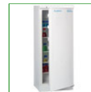
Labcold RLPR09043A Sparkfree Laboratory Fridge 285 Litres

Capacity: 284 Litre Config: Free Standing 1570mm H x 595mm W x 634mm D Product Code: FPD-09797