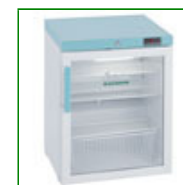
LEC PG207C - Pharmacy Fridge 82 Litre with Glass Door

Capacity: 82 Litre Config: Bench Top 660mm H x 502mm W x 540mm D Product Code: FPD-09744