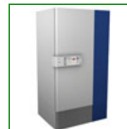
LEC ULT532 Low Temperature 500 Litre Upright Super Freezer

Capacity: 322 Litre Config: Free Standing 1985mm H x 765mm W x 900mm D Product Code: FPD-10221