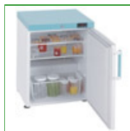
LEC LR207C Laboratory Refrigerator 82 Litre

Capacity: 60 Litre Config: Upright Refrigerator 572mm H x 485mm W x 520mm D Product Code: FPD-04912