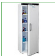
Labcold RLHD13043 Sparkfree Laboratory Fridge 360 Litres

The Sparkfree Fridges is engineered to store flammable materials safely with no sources of ignition inside the chambers. Everything that could conceivably cause a spark, such as the controller, is located outside of the refrigerator chamber making these fridges and freezers an important part of laboratory safety. Designed specifically for laboratories, these refrigerators are solidly built and come in a range of sizes, from a compact bench top to a large 400 litre refrigerator. All Sparkfree fridges are factory fitted with a door lock for optimum security.