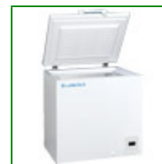
Labcold RLHE0845 Superfreezer 237 Litres

Capacity: 237 Litre Config: Chest 860mm H x 1050mm W x 735mm D