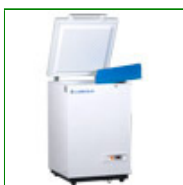
Labcold ULTF80 Compact Ultra Low Temperature Freezer 74 Litre

Labcold Compact ULT freezers utilize a Japanese adaptation of a refrigeration technique tried and tested for many years in freezers operating at temperatures as low as -150°C. Using a single, commonly available, European compressor and fewer moving parts than more conventional ULT freezers these products will provide reliable storage at temperatures down to -83°C. This new and unique range is set to revolutionize the use of ultra low temperature freezers, particularly when -80°C storage is needed close to the work place.