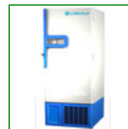
Labcold LULT2080 DuoCold Ultra Low Temperature Freezer 538 Litre

Capacity: 388 Litre Config: Chest 2020mm H x 840mm W x 985mm D Product Code: FPD-10245