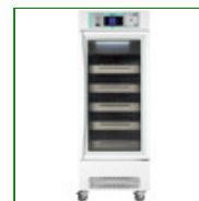
Blood Bank 360 Pack with Glass Door

Capacity: 110 Packs 1200mm H x 520mm W x 605mm D Product Code: FPD-09666