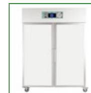
Blood Bank 864 Pack with Solid Door

Capacity: 960 Packs 1980mm H x 1340mm W x 850mm D Product Code: FPD-09671