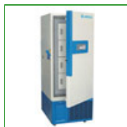
Labcold LULT1480 DuoCold Ultra Low Temperature Freezer 388 Litre

Capacity: 100 Litre Config: Chest 745mm H x 1095mm W x 750mm D Product Code: FPD-10244