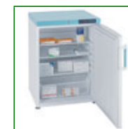
LEC PSR151UK - Pharmacy Fridge 151 Litre with Solid Door

Capacity: 151 Litre Config: Under Bench 855mm H x 550mm W x 600mm D Product Code: FPD-10545