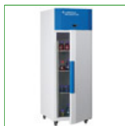
RLSD0600 Labcold Refrigerated Cooled Incubator - Solid Door

Capacity: 600 Packs Config: Free Standing 1980mm H x 720mm W x 820mm D