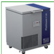
LEC CLT112 Low Temperature 113 Litre Chest Super Freezer

A variety of specialist Ultra Low Temperature Freezers Minus 40°C to Minus -85°C for the storage of chemicals, samples and other important matter.