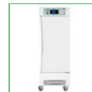
Blood Bank 360 Pack with Solid Door

Capacity: 350 Packs 1935mm H x 680mm W x 865mm D Product Code: FPD-09667