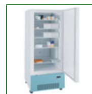
LEC PE1607C - Pharmacy Fridge 444 Litre with Solid Door

Capacity: 430 Litre Config: Free Standing 1860mm H x 600mm W x 700mm D Product Code: FPD-09844