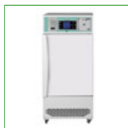
Blood Bank 72 Pack with Solid Door

Capacity: 110 Packs 1200mm H x 520mm W x 605mm D Product Code: FPD-09665