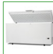
LEC CLT383 Low Temperature 383 Litre Chest Freezer

Capacity: 296 Litre Config: Chest 885mm H x 1260mm W x 600mm D Product Code: FPD-10215