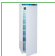
Labcold IntelliCold™ RLDF1510 - 430 Litre Pharmacy Fridge with Solid Door

All pharmacy fridges are developed with reliability and ease of use in mind. Our pharmacy refrigeration range conforms to the guidelines set out by the RPSGB and maintains an internal temperature of between +2°C and +8°C. We have added a number of improvements to certain popular models to ensure we are offering you the best possible secure and reliable refrigerated storage. Many of our fridges are available with different plug options for Europe and Australasia, or with compressors operating at 60Hz.