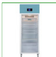
LEC PGR600UK - Pharmacy Fridge 600 Litre with Glass Door

Capacity: 600 Litre Config: Free Standing 1995mm H x 690mm W x 840mm D Product Code: FPD-10199