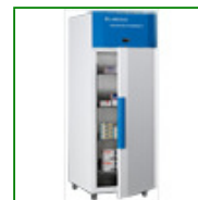
Labcold RPFR21042 - 571 Litre Advanced Pharmacy Fridge with Solid Door

Capacity: 150 Litre Config: Under Bench 820mm H x 600mm W x 620mm D Product Code: FPD-07552