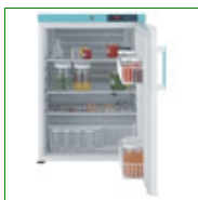
LEC LSR151 Laboratory Refrigerator 151 Litre

Capacity: 141 Litre Config: Bench Top 820mm H x 600mm W x 615mm D Product Code: FPD-10260