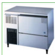
Hoshizaki Freestanding Flake/Nugget Ice Machine (110kg/24h)

Capacity: 125 kg/24h Config: Free Standing 800mm H x 940mm W x 600mm D Product Code: FPD-10237