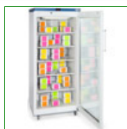
Shoreline SM541G - 544 Litres Pharmacy Fridge with Glass Door

Capacity: 544 Litre Config: Free Standing 1745mm H x 750mm W x 700mm D Product Code: FPD-07642