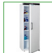
Labcold RLHF13043 Fan Air Circulated Laboratory Fridge 390 Litres

Capacity: 390 Litre Config: Free Standing 1880mm H x 580mm W x 615mm D