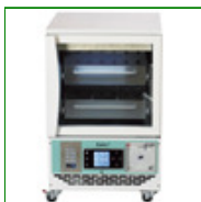
Blood Bank 48 Pack with Glass Door

Lec Medical bloodbanks have been designed in conjunction with bloodbank centres and we are proud of the many features they provide. Each bloodbank is built to order in the UK and can be delivered directly to your haematology department. All bloodbanks come with a 48 hour battery back-up for the controller, an energy efficient LED light and auto defrost as standard.