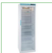
LEC PGR334UK - Pharmacy Fridge 334 Litre with Glass Door

Capacity: 300 Litre Config: Free Standing 1500mm H x 600mm W x 600mm D Product Code: FPD-09840