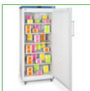
Shoreline SM541 - 544 Litres Pharmacy Fridge with Solid Door

Capacity: 444 Litre Config: Free Standing 1688mm H x 685mm W x 910mm D Product Code: FPD-09758