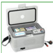
Labcold RPDF0012D Portable Medical Fridge

A selection of products designed for transportation of Vaccines and Specimen Collection. The portable refrigerator comes with an in-car power cable to keep its contents at the desired temperature whilst in transit. The Thermal Transportation bags allow for transportation of its contents over short trips approx 3 hours And the premium Vaccine carriers can hold the temperature for up to Eight hours allowing for longer transit times.