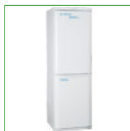
Labcold RLFF13246/LK Laboratory Fridge/Freezer 230/160 Litres

Capacity: 390 Litre 1965mm H x 595mm W x 630mm D Product Code: FPD-04937