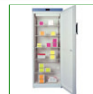
Shoreline SM360 - 352 Litres Pharmacy Fridge with Solid Door

Capacity: 352 Litre Config: Free Standing 1595mm H x 600mm W x 600mm D Product Code: FPD-04356