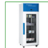
Labcold RPFG21042 - 571 Litre Advanced Pharmacy Fridge with Glass Door

Capacity: 571 Litre Config: Free Standing 1980mm H x 720mm W x 820mm D Product Code: FPD-07553