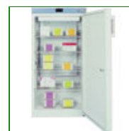
Shoreline SM260 - 252 Litres Pharmacy Fridge with Solid Door

Capacity: 252 Litre Config: Free Standing 1225mm H x 600mm W x 600mm D Product Code: FPD-04359