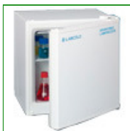
Labcold RLVF02203 Sparkfree Laboratory Freezer 36 Litres

The Labcold Sparkfree range is engineered to store flammable materials safely with no sources of ignition inside the chambers. Everything that could conceivably cause a spark, such as the controller, is located outside of the freezer chamber making these freezers an important part of laboratory safety. Designed specifically for laboratories, these freezers are solidly built and come in both upright and chest configuration. All Labcold Sparkfree freezers and chest freezers are factory fitted with a door lock for optimum security.