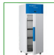
Labcold RAFR21042 Advanced Laboratory Fridge 577 Litres

Capacity: 150 Litre Config: Under Bench 830mm H x 600mm W x 620mm D Product Code: FPD-10128