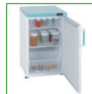
LEC LR307C Laboratory Refrigerator 107 Litre

Capacity: 82 Litre Config: Bench Top 660mm H x 502mm W x 540mm D Product Code: FPD-09794