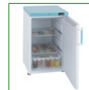
LEC ISU37C Laboratory Freezer 102 Litres

Capacity: 50 Litre Config: Bench Top 562mm H x 500mm W x 510mm D Product Code: FPD-09804