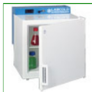
Labcold RLBF1740/LK Superfreezer 50 Litres

Capacity: 50 Litre Config: Bench Top 580mm H x 550mm W x 620mm D