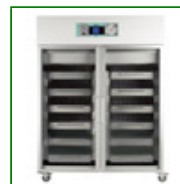
Blood Bank 864 Pack with Glass Door

Capacity: 439 Packs 1980mm H x 680mm W x 850mm D Product Code: FPD-09670