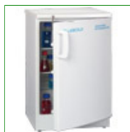
Labcold RLPR05042A Sparkfree Laboratory Fridge 160 Litres

Capacity: 151 Litre Config: Under Bench 845mm H x 595mm W x 595mm D Product Code: FPD-09796