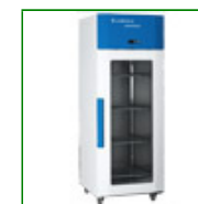
Labcold RAFG21042 Advanced Laboratory Fridge 577 Litres

Capacity: 577 Litre Config: Free Standing 1980mm H x 720mm W x 820mm D Product Code: FPD-04944