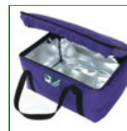
10 Litre Thermal Carry Bag with 1 Separator

Capacity: 10 Litre 220mm H x 400mm W x 280mm D