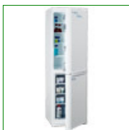
Labcold RLFF13246 Laboratory Fridge/Freezer 230/160 Litres

Capacity: 324 Litre Config: Upright Refrigerator 1870mm H x 600mm W x 600mm D Product Code: FPD-09811