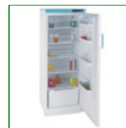
LEC LSR288 Laboratory Refrigerator 288L Litre

Capacity: 160 Litre Config: Upright Refrigerator 850mm H x 550mm W x 600mm D Product Code: FPD-07537