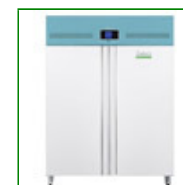
LEC PSR1200UK - Pharmacy Fridge 1200 Litre with Solid Door

Capacity: 1200 Litre Config: Free Standing 1995mm H x 1330mm W x 840mm D Product Code: FPD-10202