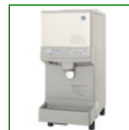
Hoshizaki Countertop Ice/Water Dispenser (125kg/24h)

Capacity: 32 kg/24h Config: Free Standing 1600mm H x 350mm W x 500mm D Product Code: FPD-10232