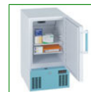
LEC PE102C - Pharmacy Fridge 41 Litre with Solid Door

Capacity: 41 Litre Config: Bench Top 702mm H x 379mm W x 500mm D Product Code: FPD-09752