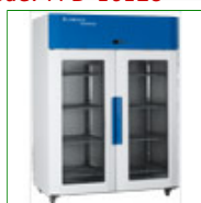
Labcold RAFG44042 Advanced Laboratory Fridge 1245 Litres

Capacity: 1245 Litre Config: Free Standing 1980mm H x 1440mm W x 820mm D Product Code: FPD-04945