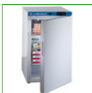
Labcold IntelliCold™ RLDF0210 - 66 Litre Pharmacy Fridge with Solid Door

All pharmacy fridges are developed with reliability and ease of use in mind. Our pharmacy refrigeration range conforms to the guidelines set out by the RPSGB and maintains an internal temperature of between +2°C and +8°C. We have added a number of improvements to certain popular models to ensure we are offering you the best possible secure and reliable refrigerated storage. Many of our fridges are available with different plug options for Europe and Australasia, or with compressors operating at 60Hz.