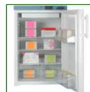
Shoreline SM1502 - 151 Litres Pharmacy Fridge with Solid Door

Capacity: 150 Litre Config: Under Bench 820mm H x 600mm W x 610mm D Product Code: FPD-09838