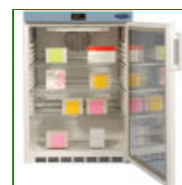
Shoreline SM161G - 141 Litres Pharmacy Fridge with Glass Door

Capacity: 107 Litre Config: Under Bench 830mm H x 495mm W x 620mm D Product Code: FPD-09745