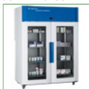
Labcold RPFG44042 - 1245 Litre Advanced Pharmacy Fridge with Glass Door

Capacity: 1245 Litre Config: Free Standing 1980mm H x 1440mm W x 820mm D Product Code: FPD-06566