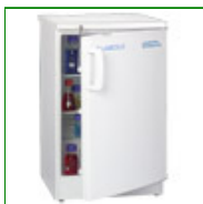
Labcold RLPF05042A Fan Air Circulated Laboratory Fridge 160 Litres

Fan circulated refrigerators are designed for temperature uniformity throughout the chamber of the refrigerator. Where not integral, all fan circulated fridges can be factory fitted with high/ low temperature alarms and digital temperature displays. Available in a range of sizes, all models feature a door lock for extra security and adjustable shelves so you can make the most of the space available.