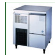
Hoshizaki Freestanding Flake/Nugget Ice Machine (110kg/24h)

Capacity: 125 kg/24h Config: Free Standing 800mm H x 640mm W x 600mm D Product Code: FPD-10235