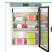
Shoreline SM60G - 60 Litres Pharmacy Fridge with Glass Door

Capacity: 53 Litre Config: Bench Top 592mm H x 486mm W x 494mm D Product Code: FPD-09819