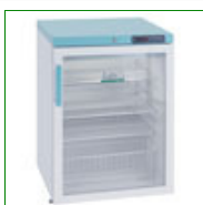
LEC PGR151UK - Pharmacy Fridge 151 Litre with Glass Door

Capacity: 151 Litre Config: Under Bench 845mm H x 595mm W x 635mm D Product Code: FPD-09746