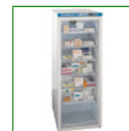
Labcold IntelliCold™ RLDG1010 - 300 Litre Pharmacy Fridge with Glass Door

Capacity: 300 Litre Config: Free Standing 1500mm H x 600mm W x 660mm D Product Code: FPD-09839