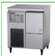
Hoshizaki Freestanding Flake/Nugget Ice Machine (85kg/24h)

Compact ice/water dispenser - Perfect for use in busy areas where people need access to an ongoing fresh water and ice supply, such as a hospital ward. Hygienic ice production - Ice moves straight to an airtight storage hopper as soon as it is produced, so it has no contact with light or air until it is dispensed, keeping its hygienic integrity.