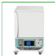
Blood Bank 48 Pack with Solid Door

Capacity: 78 Packs 780mm H x 522mm W x 600mm D Product Code: FPD-09661