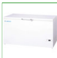
Labcold ULTF320 Compact Ultra Low Temperature Freezer 276 Litre

Capacity: 74 Litre Config: Chest 875mm H x 550mm W x 645mm D Product Code: FPD-04990