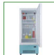
LEC LR1607C Laboratory Refrigerator 474 Litre

Capacity: 400 Litre Config: Upright Refrigerator 1860mm H x 600mm W x 695mm D Product Code: FPD-07707