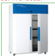
Labcold RAFR44042 Advanced Laboratory Fridge 1245 Litres

Capacity: 577 Litre Config: Free Standing 1980mm H x 720mm W x 820mm D Product Code: FPD-04951