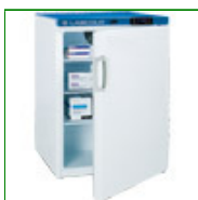
Labcold IntelliCold™ RLDF0510 - 150 Litre Pharmacy Fridge with Solid Door

All pharmacy fridges are developed with reliability and ease of use in mind. Our pharmacy refrigeration range conforms to the guidelines set out by the RPSGB and maintains an internal temperature of between +2°C and +8°C. We have added a number of improvements to certain popular models to ensure we are offering you the best possible secure and reliable refrigerated storage. Many of our fridges are available with different plug options for Europe and Australasia, or with compressors operating at 60Hz.