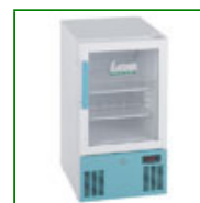
LEC PG102C - Pharmacy Fridge 41 Litre with Glass Door

Capacity: 36 Litre Config: Bench Top/Wall Mounted 535mm H x 445mm W x 465mm D Product Code: FPD-09835