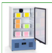
Shoreline SM75 - 75 Litres Pharmacy Fridge with Solid Door

Capacity: 66 Litre Config: Bench Top/Wall Monted 725mm H x 450mm W x 485mm D Product Code: FPD-09836