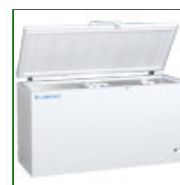
Labcold RLCF2120 Sparkfree Laboratory Freezer 607 Litres

Capacity: 447 Litre Config: Chest Freezer 860mm H x 1300mm W x 730mm D Product Code: FPD-04935