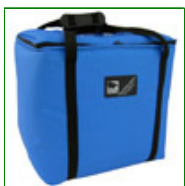
30 Litre Thermal Carry Bag with 3 Separators

Capacity: 30 Litre 360mm H x 400mm W x 340mm D