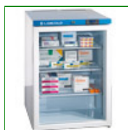
Labcold IntelliCold™ RLDG0510 - 150 Litre Pharmacy Fridge with Glass Door

Capacity: 150 Litre Config: Under Bench 820mm H x 600mm W x 610mm D Product Code: FPD-09837