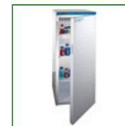
RLSD0300 Labcold Refrigerated Cooled Incubator - Solid Door

Capacity: 300 Packs Config: Free Standing 1487mm H x 600mm W x 650mm D