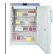
Shoreline SM161 - 141 Litres Pharmacy Fridge with Solid Door

Capacity: 141 Litre Config: Under Bench 835mm H x 600mm W x 615mm D Product Code: FPD-08130