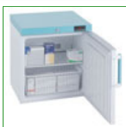
LEC PE109C - Pharmacy Fridge 45 Litre with Solid Door

Capacity: 41 Litre Config: Bench Top 702mm H x 379mm W x 500mm D Product Code: FPD-09742