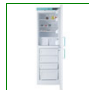
LEC LSC263UK Laboratory Fridge Freezer

Capacity: 119 Litre Config: Under Bench 860mm H x 540mm W x 600mm D Product Code: FPD-09809