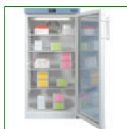
Shoreline SM260G - 252 Litres Pharmacy Fridge with Glass Door

Capacity: 151 Litre Config: Under Bench 845mm H x 595mm W x 635mm D Product Code: FPD-09755