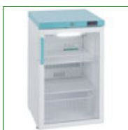
LEC PG307C - Pharmacy Fridge 107 Litre with Glass Door

Capacity: 82 Litre Config: Bench Top 660mm H x 502mm W x 450mm D Product Code: FPD-09753