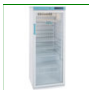
LEC PGR273UK - Pharmacy Fridge 273 Litre with Glass Door

Capacity: 273 Litre Config: Free Standing 1565mm H x 595mm W x 670mm D Product Code: FPD-09747