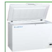
Labcold RLHE1145 Superfreezer 314 Litres

Capacity: 314 Litre Config: Chest 860mm H x 1305mm W x 735mm D