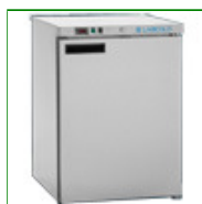
Labcold RAFG05043 Advanced Laboratory Fridge 150 Litres with Glass Door

Capacity: 150 Litre Config: Under Bench 830mm H x 600mm W x 620mm D Product Code: FPD-10127