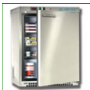
Labcold RPFR05043 - 150 Litre Advanced Pharmacy Fridge with Solid Door

The Labcold Advanced Pharmacy range of refrigerators represents the highest levels of performance, constructional quality, robustness, and appearance available in the market place. Heavy-duty all-metal construction provides strength and durability with ease of cleaning or sanitisation. Microprocessor control, together with ducted airflow and advanced auto defrost system provide class leading temperature stability and uniformity.