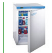
RLSD01502 Labcold Cooled Incubator with Solid Door

Capacity: 150 Packs Config: Under Bench 820mm H x 600mm W x 600mm D