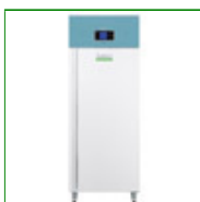
LEC PSR600UK - Pharmacy Fridge 600 Litre with Solid Door

All pharmacy fridges are developed with reliability and ease of use in mind. Our pharmacy refrigeration range conforms to the guidelines set out by the RPSGB and maintains an internal temperature of between +2°C and +8°C. We have added a number of improvements to certain popular models to ensure we are offering you the best possible secure and reliable refrigerated storage. Many of our fridges are available with different plug options for Europe and Australasia, or with compressors operating at 60Hz.