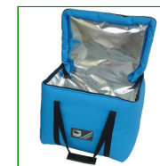
20 Litre Thermal Carry Bag with 2 Separators

Capacity: 20 Litre 330mm H x 400mm W x 280mm D