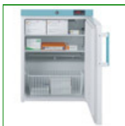
LEC WR207C Ward Refrigerator 82 Litre

This range provide the secure storage of foodstuffs within the ward environment. The newly improved range operate at +3°C with an available operating range of +1° to +5°C, all refrigerators come with lockable doors, external temperature controller and have a two year warranty .