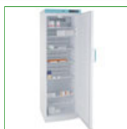
LEC PSR334UK - Pharmacy Fridge 334 Litre with Solid Door

Capacity: 334 Litre Config: Free Standing 1860mm H x 595mm W x 660mm D Product Code: FPD-09757